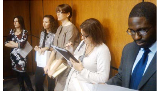
above, and left: Volunteers working AWL's 2011 Step Up for Women in Shelters