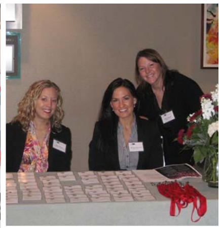
Exhibitors and volunteers making the first annual conference a success